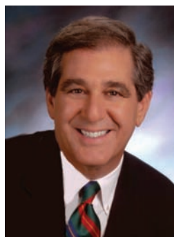
The Honorable Jerry Abramson, Mayor of Louisville